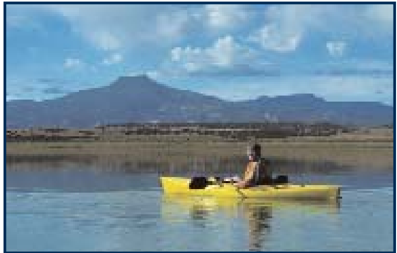
Paddling on the Abiquiu Reservoir truly is an adventure.

So are you ready to get outside, challenge yourself, and immerse yourself in outdoor activities? Our adventures will include paddling on Abiquiu Reservoir, a group-planned day hike, sunset hikes and climbing on the challenge courses. Join us for outdoor adventures! This seminar, designed for folks of all ages, provides a sampler of some of the many activities and adventures in the wonderful outdoor environment of Ghost Ranch. You will have the opportunity to empower yourself, get to know your teammates and discover your own personal capabilities and strengths. No experience necessary! Minimum age: 14 (questions about the course, or if under 14 and interested, contact the Outdoor Adventure office by email at: oa@ghostranch.org ).