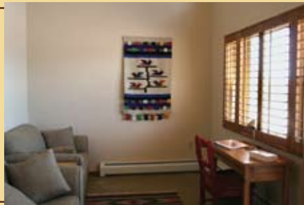
Common Living Area

*Larger groups can be served in other types of lodging.